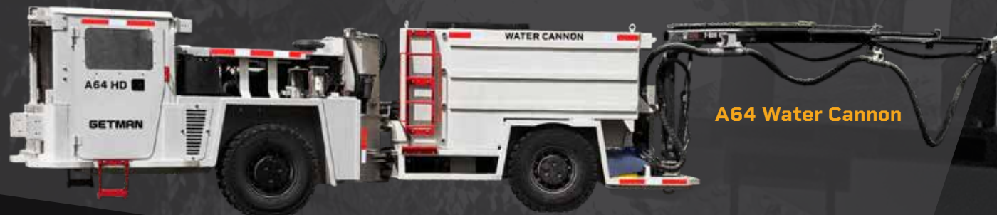
A64 Water Cannon

Tel +1 (269) 427-5611 info@getman.com getman.com