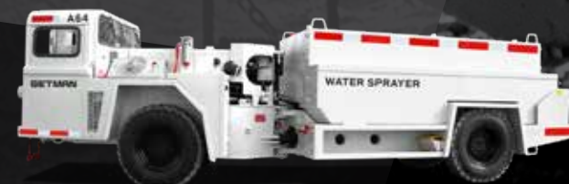
A64 Water Sprayer