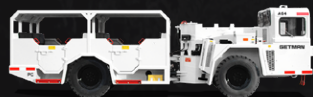
A64 Personnel Carrier